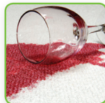
Food & Wine Spills