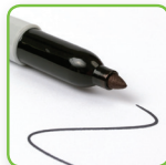
Pen, Crayon & Marker