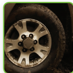
Grease, Tar & Oil Stains