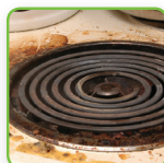
Greasy Ovens & Stains