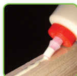
Adhesive & Chewing Gum