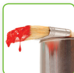
Dry Latex Paint

Dry latex paint, pet stains, oven grime, soap scum, pen, crayon, marker, food & wine spills, chewing gum, adhesive, glue, grease, tar & oil stains, make-up, and many more.